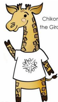
Chikondi the Giraffe